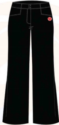
Bootleg Trousers with Embroidered Logo