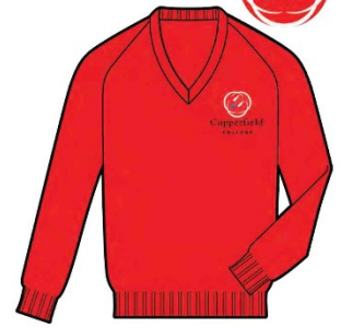
Wool Jumper with Embroidered Logo