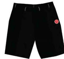
Pleated Fly Front Shorts with Embroidered Logo