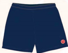
Sports Shorts with Embroidered Logo