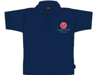
Polo with Embroidered Logo