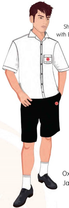
Short Sleeve Shirt with Embroidered Logo