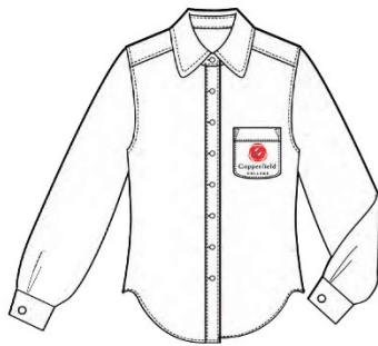
Long Sleeve Blouse with Embroidered Logo