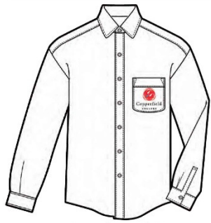
Long Sleeve Shirt with Embroidered Logo