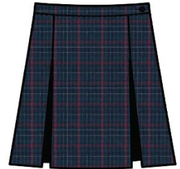
Girls' Box-Pleat Winter Skirt