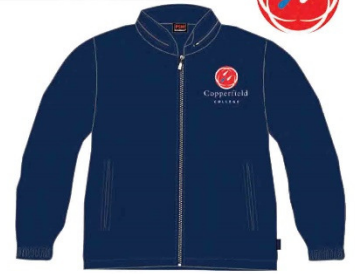
Oxford Jacket with Embroidered Logo