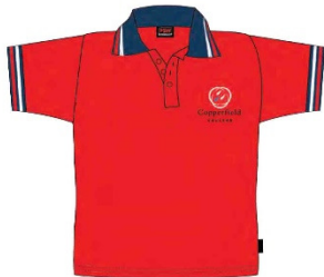
Sports Polos with Embroidered Logo