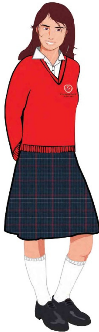
Girls' Winter Uniform