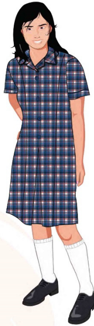
Girls' Summer Uniform