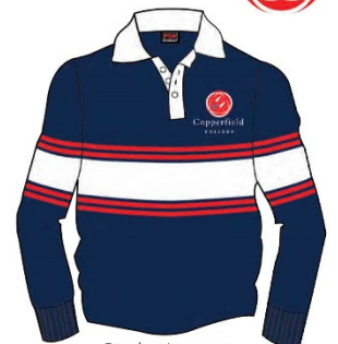
Rugby Jumper with Embroidered Logo